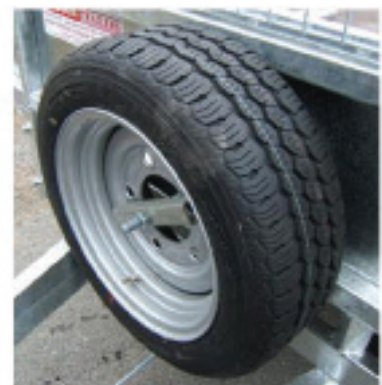
Spare wheel & bracket

This can be attached to the front or side of any trailer.