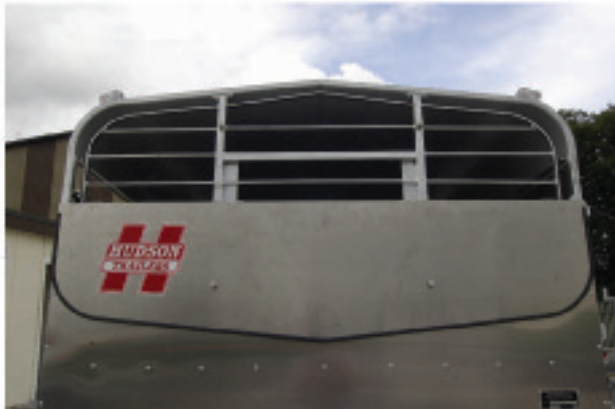
Fold Down Front